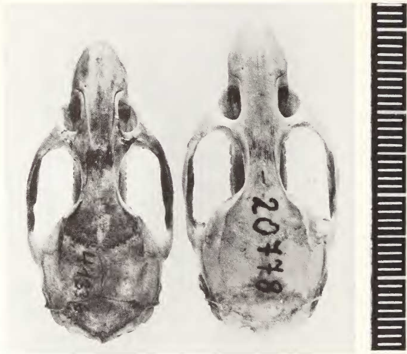
Fig. 2: O. occidentalis , holotype (left) and O. irroratus showing the different size of skulls and difference in breadth and angle of nasals.

and Nigeria the question arises whether it is closely related to O. lacustris and O. barbouri .